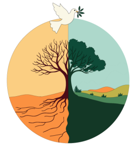
Garden of Peace Isaiah 32:14-18

This year's theme is the Garden of Peace and the chosen text this year is Isaiah 32:14-18. We are asked to reflect on the connection between caring for creation and fostering peace.