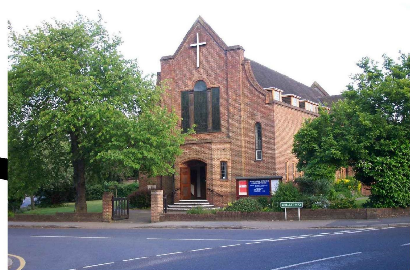
Christ Church Tudor Way, Petts Wood BR5 1LH